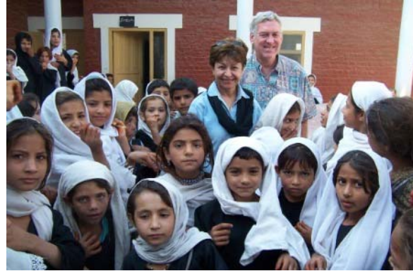
Pictured above is opening day at the school.