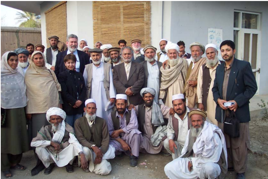
Jalalabad Sister Cities Committee March 2004